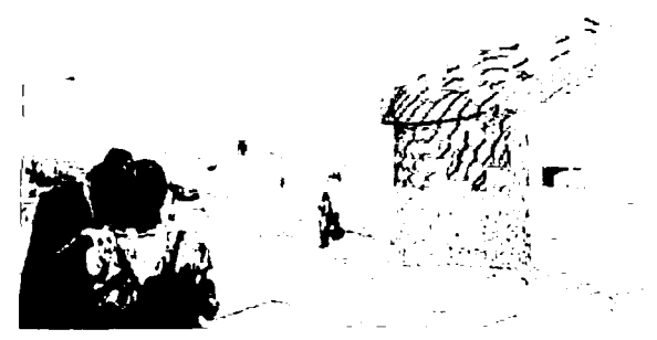
Figure 1. Memorial view.

The first project is a finalist entry for the National AIDS Memorial located in Golden Gate Park. While the location was specific, the design included more a technique for making objects with in a loose landscape. The specific response within itself included variations of a particular system employed across an existing landscape.