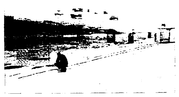
Figure 2. Memorial view.

The wire-mesh-components shape space, they are meshes which consist of braids and linkages, a form of architectural drapery, like