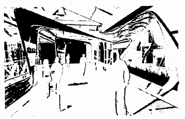
Figure 3. Urban Art Pavilion view.

The Obvita Slide project is a proposed art pavilion that avoids the enclosed and separate nature of "pavilion," and instead creates pavilion-less-ness: an open, permeable framework. It is a performative envelope that