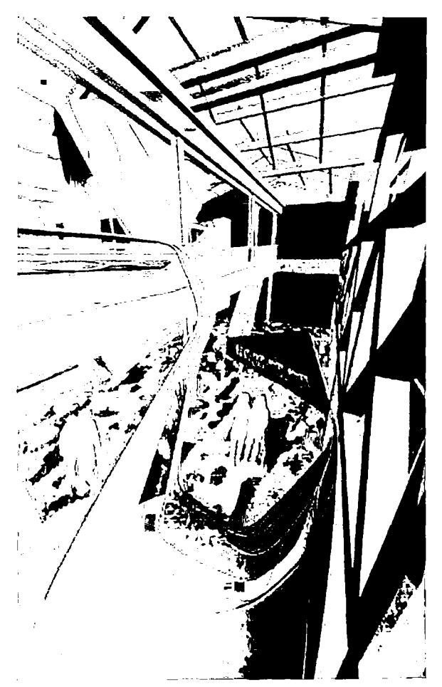
Figure 4. Urban Art Pavilion view.

the surface and the public spaces it defines. Art could also be hung in place of the panels or from the aluminum extrusions. Viewers can experience the artwork both from inside and out-- or through the slide display surfaces. While the slide expands to move through the urban area as a system, it is easily demountable and, when stacked, comfortably fits into a small space for storage. The panels are simply fastened to the aluminum tubes which are themselves slotted to fit together much like tent poles.